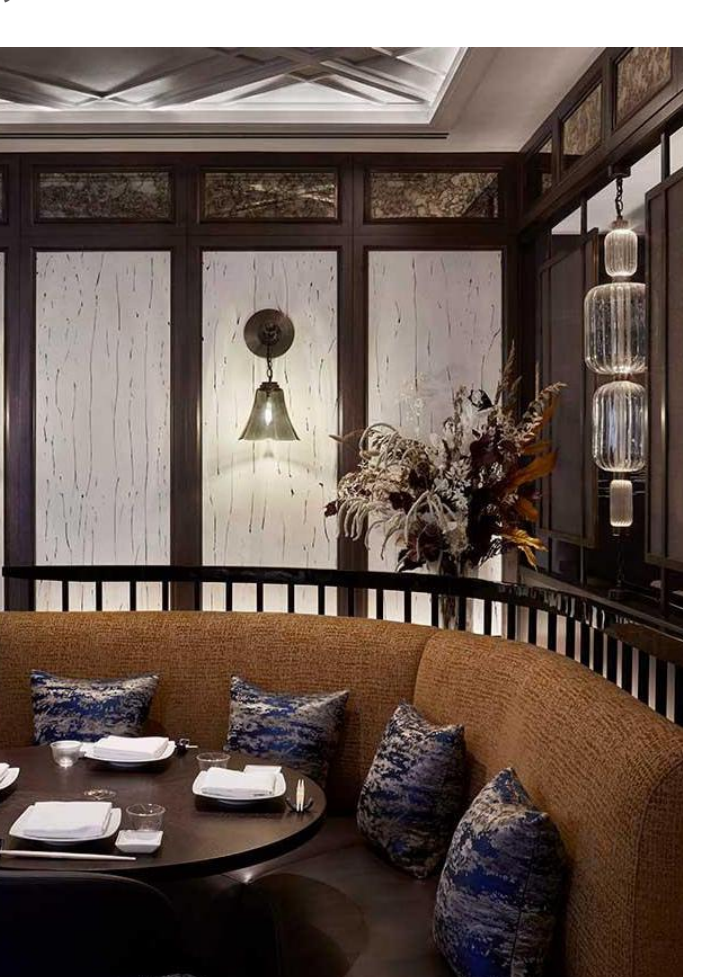
Kyubi Restaurant - The Arts Club