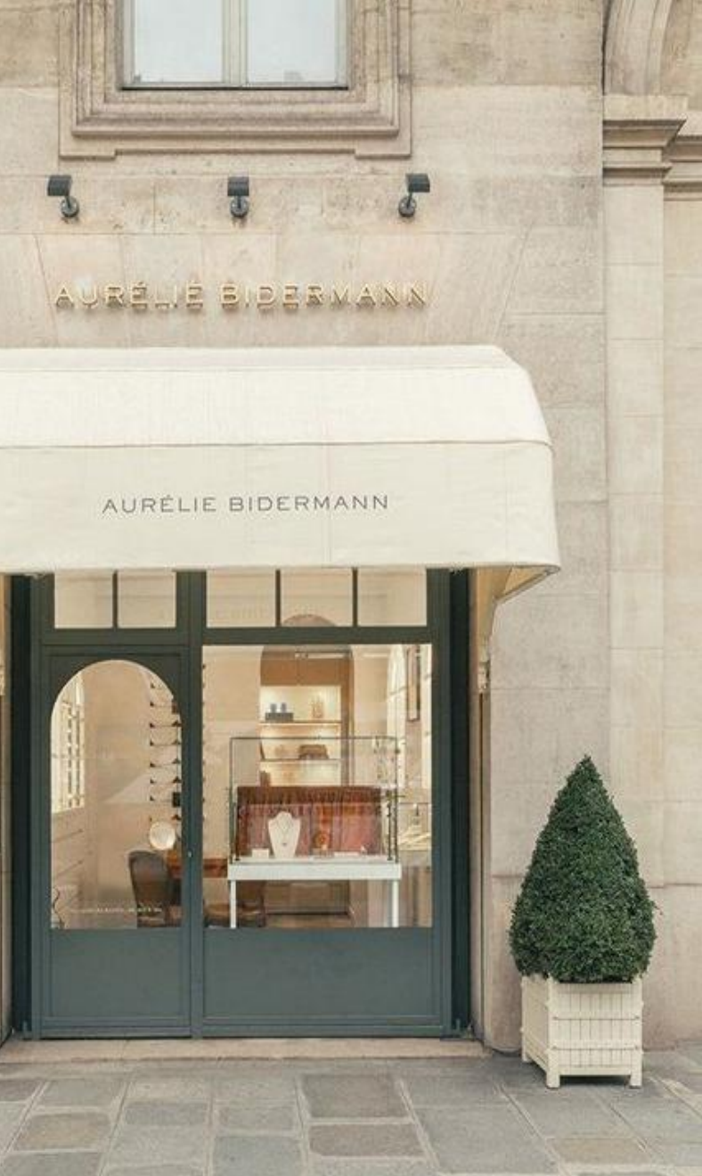
COMBO OF CONTRASTING NEUTRALS