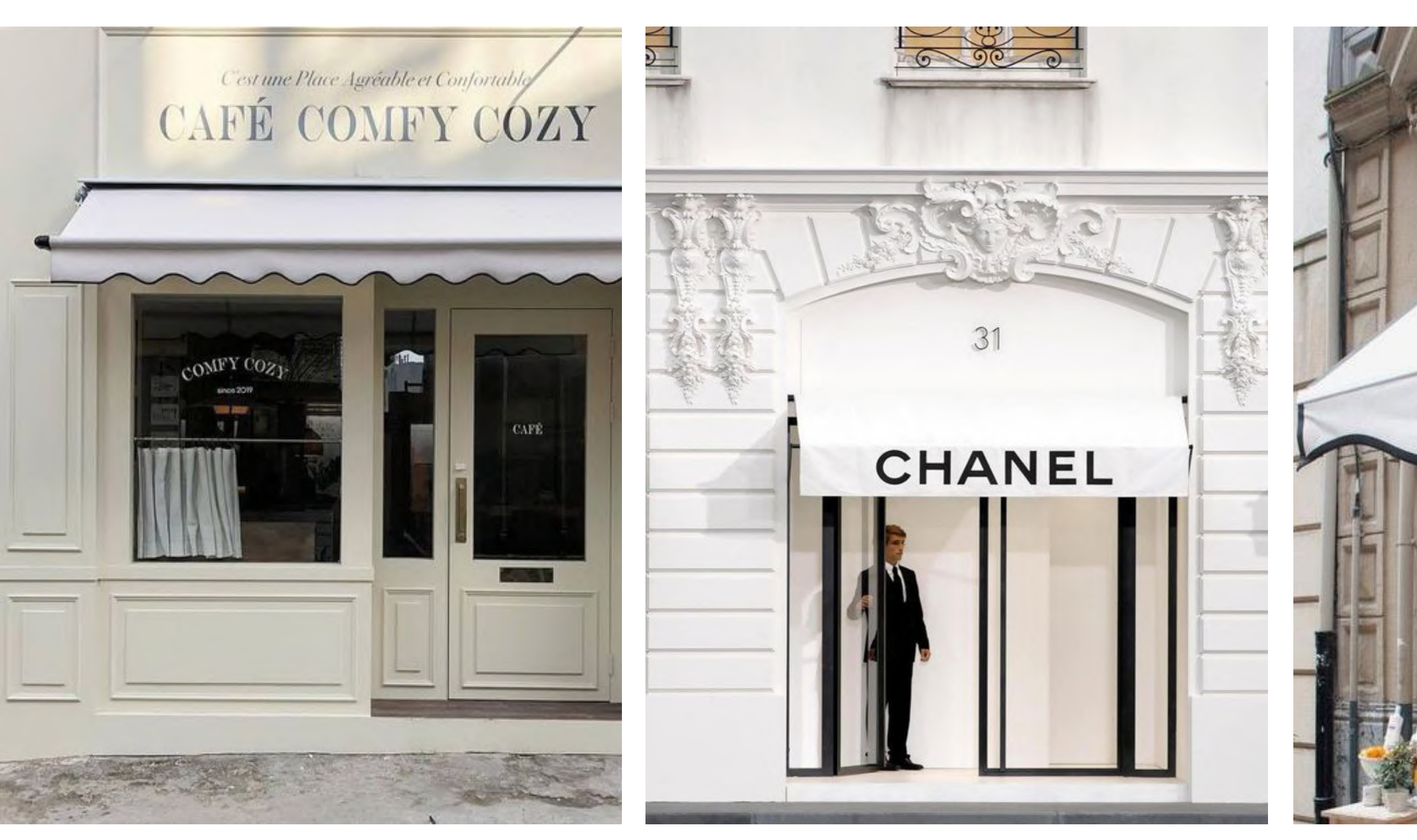
STRAIGHT, CLEAN AND LINEAR